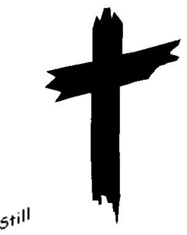
There's room at the cross for YOU!

"Imagine, if you will for a moment, that God took a sponge and sopped up all the sins of the whole world; then placed it over Jesus' head and squeezed out the sins of the whole world onto Him, including yours and mine."